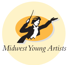
Midwest Young Artists

With a vision to create an exceptional environment for young musicians, Midwest Young Artists provides its students with outstanding music ensemble experiences and amazing performance opportunities, while preserving a supportive and nurturing environment.